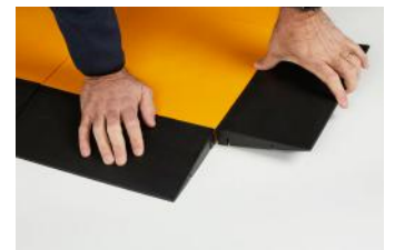
Edging Ramps Available